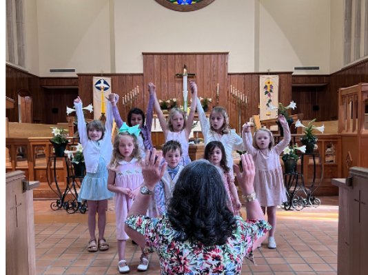
Alleluia! Chirst is risen! Christ isrisen indeeed! Alleluia!