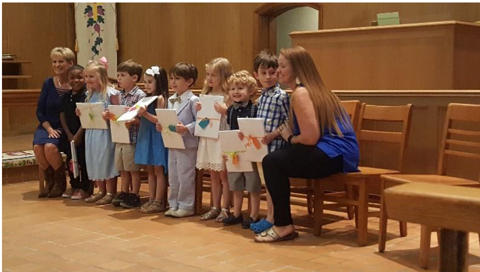
Recent CDC Graduation Class of Four Year Olds. Going to preschool in the fall.