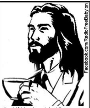
And if I had a nickel for every time I've heard that one, I could build...I dunno...like a big giant nickel house or something.