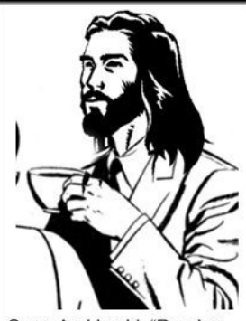
Sure. And I said, "Render unto Caesar the things which are Caesar's, etcetera, etcetera." That was a good one. Stumped those boys.