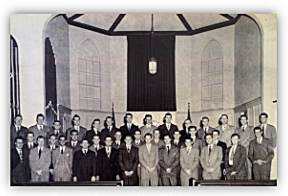
Incarnation's veterans, pictured in the sanctuary on their return at War's end. Five members were killed in the conflict.

Pastor Meetze wrote monthly newsletters to Incarnation's men in service during the war, keeping them up to date on each other and on the home front.