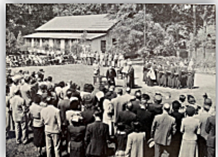
Groundbreaking for the Education Building, September 25, 1949. Note President of SC Synod, Karl Kinard (Porter Kinard's father) in top picture on right.

Congregational "sentiment" led to the preservation of "the persimmon tree" in front of the new proposed building. The Property Committee was directed to take all "necessary steps to protect said tree."