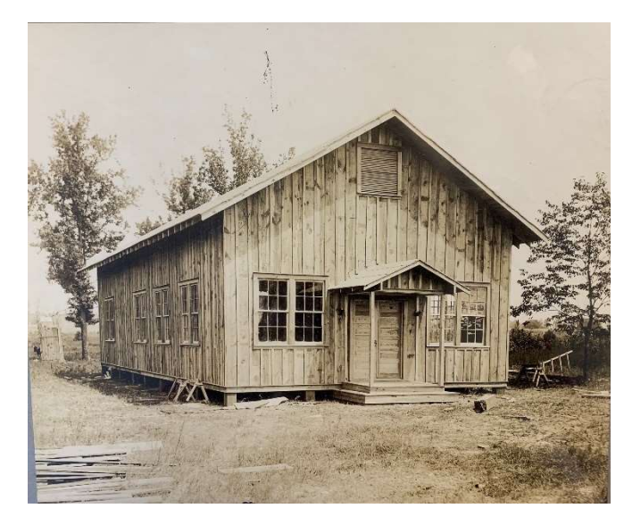
Meals were provided by women of the churches every day of construction.