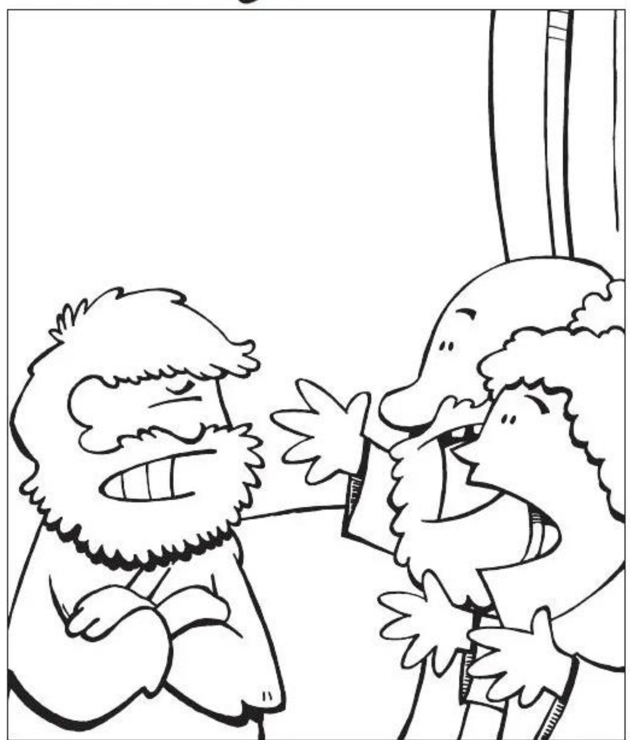
Thomas was the only disciple not there that night. When he got back, the others excitedly told him about Jesus' visit.